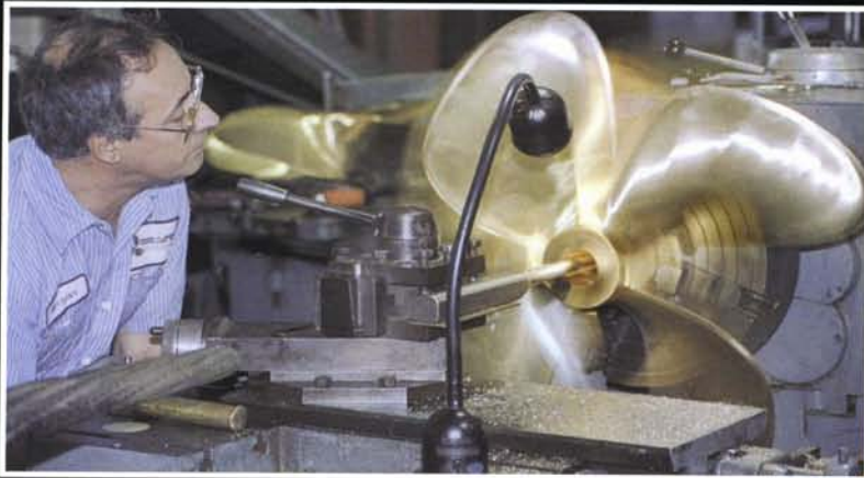
FRANK & JIMMIE'S PROPELLER SHOP

2006 RECOGNITION OF EXCELLENCE AWARDS BANQUET FEATURING MANUFACTURERS OF THE YEAR & EMPLOYEES OF THE YEAR