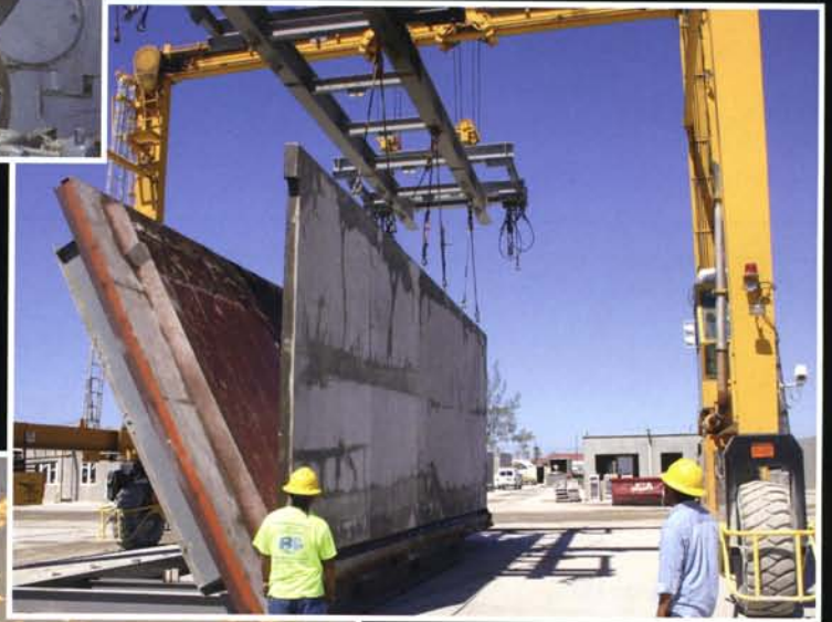
ROYAL CONCRETE CONCEPTS, INC.